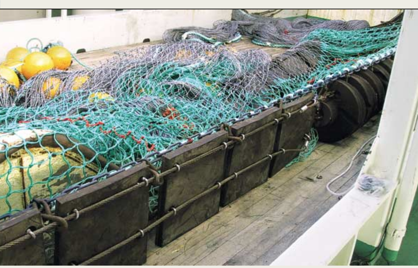
Fullscale sheering ground gear.

During towing, the Rockhopper gear discs on the trawl wings are oriented virtually at right angles to the direction of towing. This produces a considerable amount of resistance in the form of both bottom friction and water resistance. Since the Rockhopper ground gear was adopted about 15–20 years ago, trawlers have had to increase the size of their trawl doors (both weight and area), with the result that they are now at least twice as big as they were ten or fifteen years ago. The greater resistance of Rockhopper gear is not the only reason for the increase in the size of trawl doors – the trawls themselves have also become bigger and stronger, and towing speeds are often higher than they used to be.