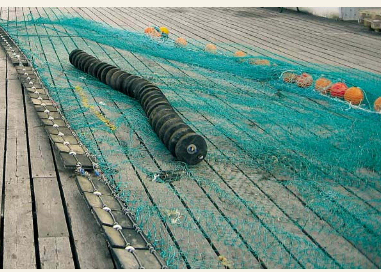
Bottom trawl with sheering ground gear.

were observed by TV from a towed underwater vehicle and measured using Scanmar instruments. These trials confirmed earlier model experience, that when they are installed as side-gear, plates have improved spreading ability and that they pass well over stony ground. It was also documented that the way in which the gear is rigged is critical for good contact with the bottom. The gear can be rigged in such a way that the plates either tend to lift or dive. The angle of the plates can in this way be used to control bottom contact. An inclinometer on the plates and a Scanmar sensor that indicates the distance to the bottom both turned out to be useful instrumentation for monitoring bottom contact during towing.