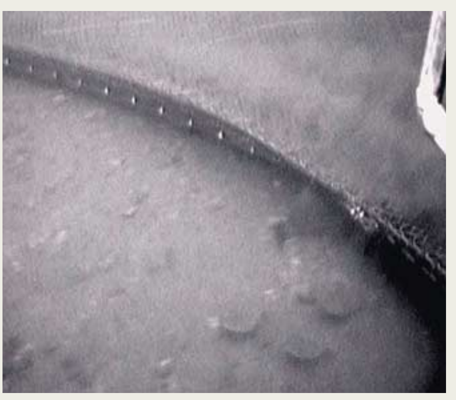
Wing gear of rubber plates.

interesting when we consider a survey trawl designed for making more accurate biomass measurements of demersal fish stocks. This possibility, which is due not least to the development of the new bottom trawl-gear concept, is already internationally recognised.